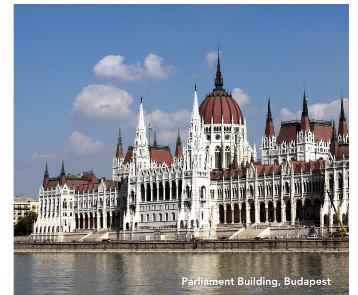
Parliament Building, Budapest

Visit the Old Town and the site of the Warsaw ghetto during your morning sightseeing tour with an expert Local Guide. Admire the Palace of Culture and Science. Later, don't miss a trip to the Wilanow Palace, the residence of Polish King Jan Sobieski. Tonight after dinner at the hotel, you might like to attend a classical music recital. ( BB )