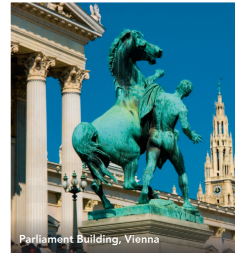
Parliament Building, Vienna