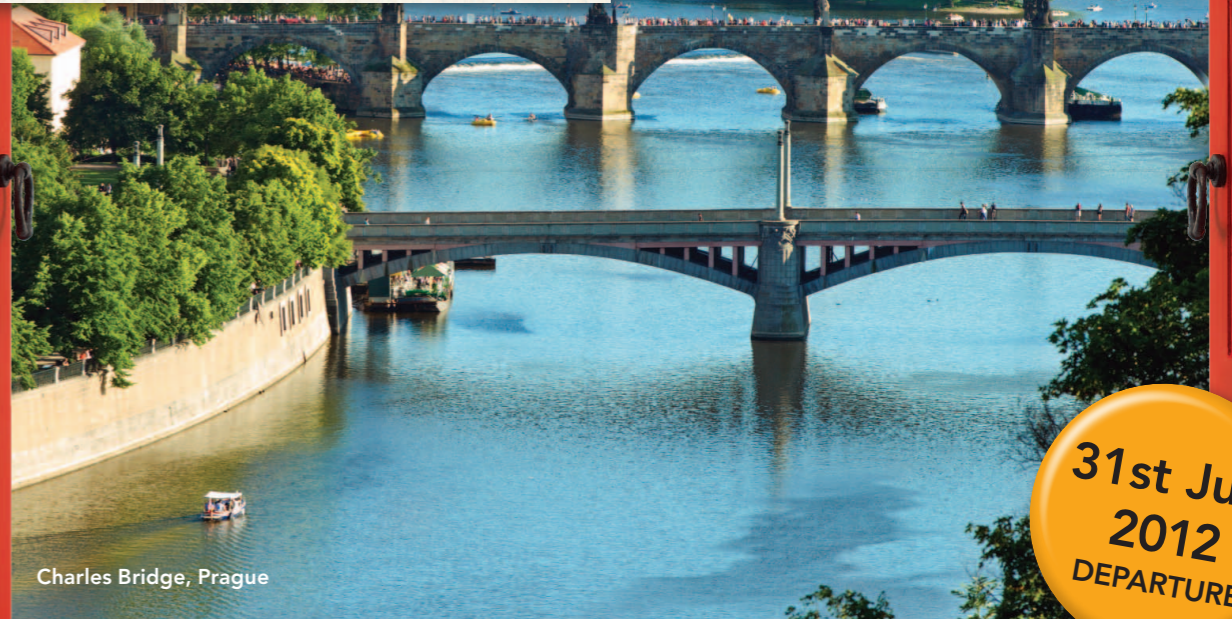
Charles Bridge, Prague