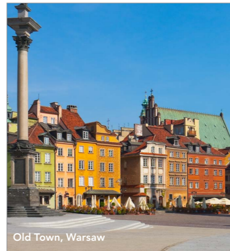
Old Town, Warsaw

21 Days from $7,199 per person twin share